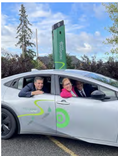
Happy to have participated, alongside CREDDO, in the launch of Horizons Partagés, an innovative hybrid car-sharing project, supported by our government through a $500,000 grant from the Green Municipal Fund of the Federation of Canadian Municipalities.