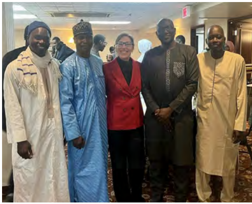
An unforgettable moment shared during an Iftar with the Mouride community in Outaouais.

Thanks to an investment of over $5 million from our government, through the Rapid Housing Initiative, we inaugurated 26 apartments in Gracefield, which will provide shelter to those who need it most: our seniors, low-income individuals, and those with reduced mobility.