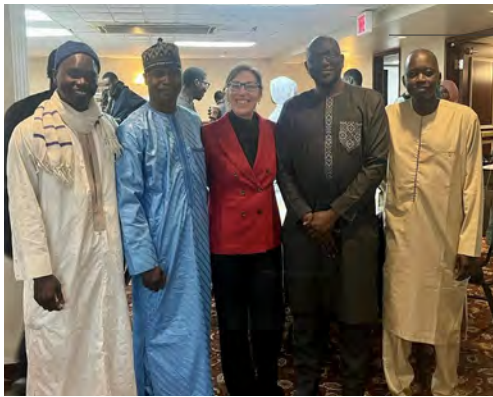
An unforgettable moment shared during an Iftar with the Mouride community in Outaouais.

Thanks to an investment of over $5 million from our government, through the Rapid Housing Initiative, we inaugurated 26 apartments in Gracefield, which will provide shelter to those who need it most: our seniors, low-income individuals, and those with reduced mobility.