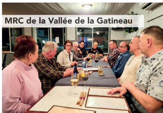
MRC de la Vallée de la Gatineau

Chelsea Chelsea Pub avec les maires et le préfet de la MRC des Collines. // Here at the Chelsea Pub with mayors and warden MRC des Collines.