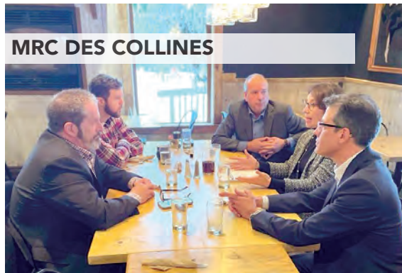
MRC DES COLLINES

Un des volets les plus gratifiants de mon travail en tant que députée de Pontiac est de supporter le précieux travail des élus municipaux. Il est important de comprendre les enjeux locaux, la vision des maires et mairesses et de faciliter la collaboration. // One of the most rewarding parts of my job as MP is to support the precious work of elected municipal officials. It is important to understand local issues, the vision of the mayors and to facilitate collaboration.