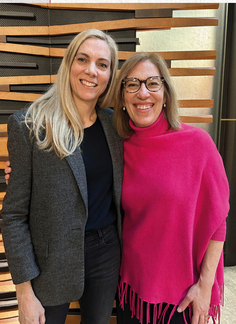
With the Honorable Pascale St-Onge, Minister of Canadian Heritage

Despite this significant commitment, many community radio stations and local newspapers remain at risk of closure. I continue to work alongside my fellow Liberal MPs from rural regions to encourage the government to allocate a significant portion of its advertising budgets to local media. This measure would ensure a sustainable source of income, essential for maintaining a diverse and independent press throughout Canada.